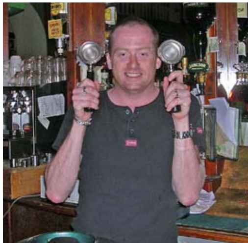
They serve coffee in Tig Barra, according to Enda.