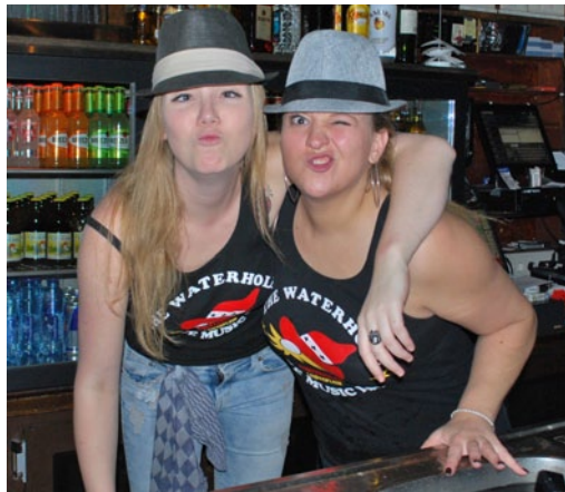
It's double trouble in the Waterhole when both Lottes are working.