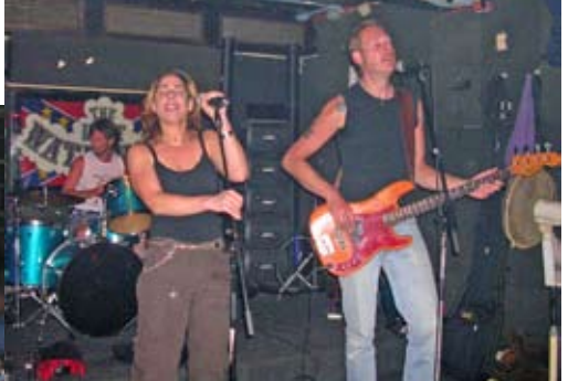
Road Dawgz in Maloe Melo...