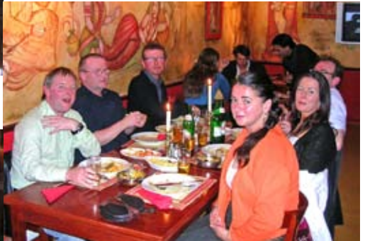
They all agreed, the meal in Kamasutra was better than anything they can get in Westport and was as good as you can get in Leicester. Praise indeed, because Leicester's famous for its Indian restaurants.

Did a bit of lounging in the Wonder Bar.