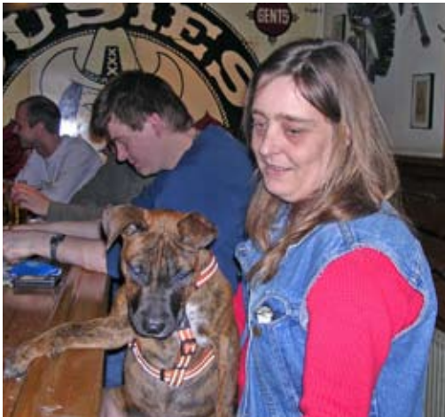
Zippy introduced us to Flozzy (pronounced Floosie) in Susie's Saloon.