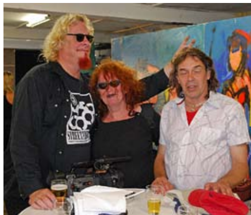
Plenty of media coverage, with Mr CultTV, Evertjan and Maartje from buurt-online.nl.