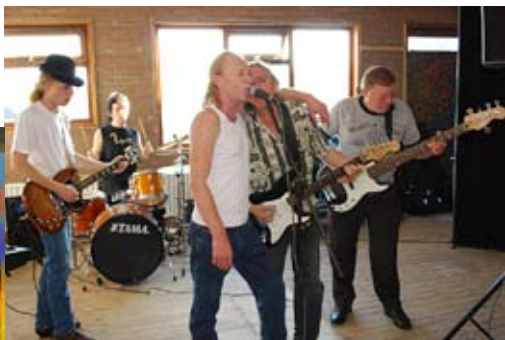
The musicians were "Livin The Dream".