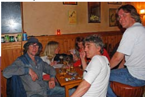
Erik Op Vakantie shared the fourth spot...

Only one point separated the teams for the next four places: