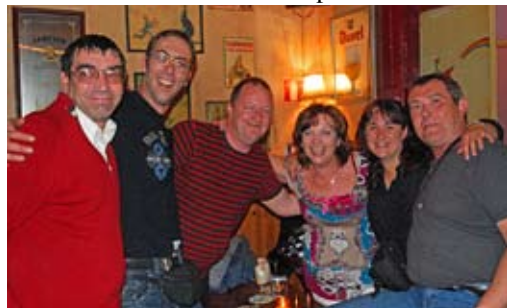
Runners-up were SLB with 43 points.