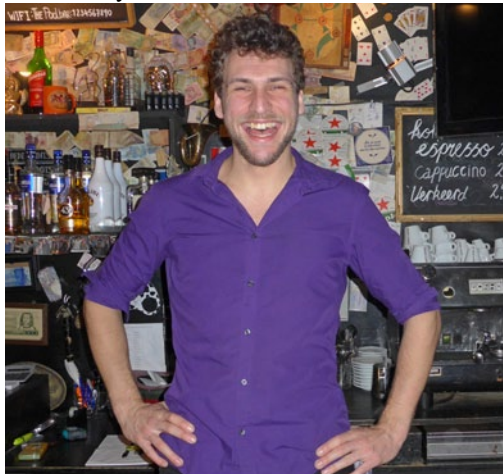
Wam in The Poolbar