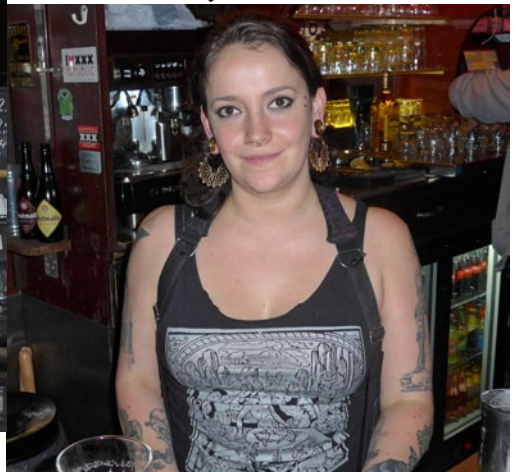
Ruby in Excalibur