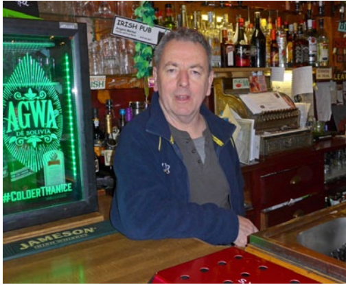
Little Paddy in the Blarney Stone