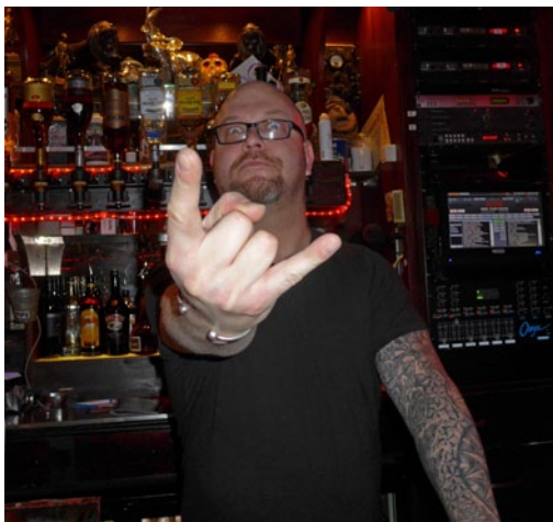
Skip in Excalibur